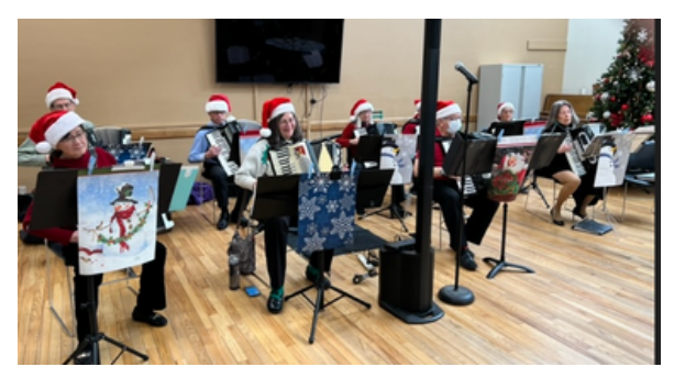
ProMedica, for sponsoring the Winter Special Luncheon and to the Albuquerque Accordion Club for entertaining us with their music.